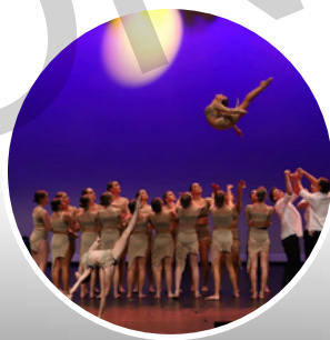
PERFORMANCE TEAMS & EXAMS